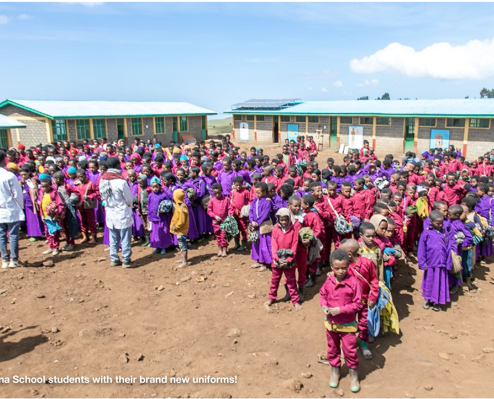
na School students with their brand new uniforms!